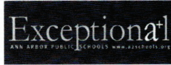
PHOTO GALLERY-LOOK AT WHAT WE'RE UP TO! (/PHOTO-GALLERY-LOOK-AT-WHAT-WERE-UP-TO.HTML)

DISTRICT SCHOOL CALENDAR (/DISTRICT-SCHOOL-CALENDAR.HTML)